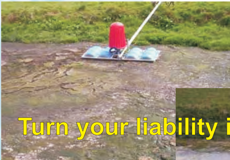
EFFLUENT BEFORE TREATMENT (ANAEROBIC DIGESTION)