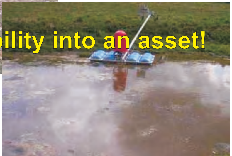
EFFLUENT AFTER TREATMENT (AEROBIC DIGESTION)